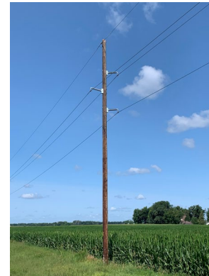
Typical 69-kV wood single circuit structure without distribution underbuild

The transmission line will be rebuilt using single wood poles generally 55 to 75 feet above ground, placed 200 to 400 feet apart. Poles will likely be in similar locations to existing. Directional changes or angles may require guy wires and anchors to stabilize poles. In certain situations, engineered laminated poles may be used.