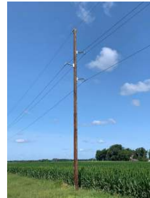
Typical 69-kV wood single circuit structure without distribution underbuild

The transmission line will be rebuilt using single wood poles generally 55 to 75 feet above ground, placed 200 to 400 feet apart. Poles will likely be in similar locations to existing. Directional changes or angles may require guy wires and anchors to stabilize poles. In certain situations, engineered laminated poles may be used.