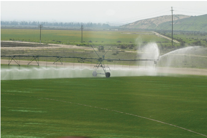
Never allow a solid stream of water to hit a transmission line wire.