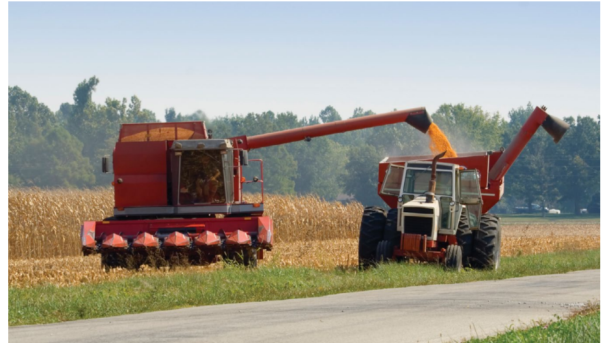
Look up! Equipment that can be extended, such as a grain elevator or stack mower, requires the utmost care when near a power line.

A. If you are considering operating a vehicle within a height greater than 14 feet, please contact your local electric utility or Great River Energy. Be sure to call first even if it appears the line is more than 14 feet above the ground.