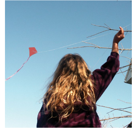
DO NOT fly kites or model planes near any power line.

When the weather is nice, we want to get outside and play. You can enjoy many recreational activities near power lines, but some activities require caution. Flying kites, building fires or hunting are all activities that require you to be aware of your proximity to power lines. Additionally, never climb towers, fences or any other structure near a power line or an electrical substation. During storms, stay away from all tall objects.