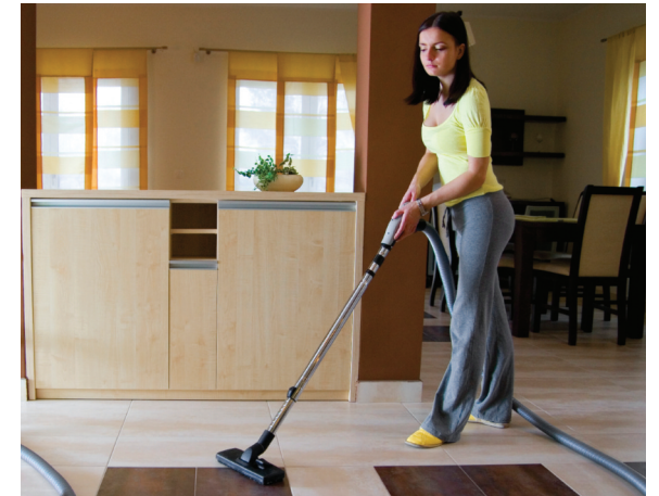
We are all exposed to EMF everyday from appliances and anything that uses, generates or distributes electricity. When you are operating a common vacuum cleaner or standing within six inches, you may be exposed to a magnetic field of 300 mG. See Figure 1.

These terms are often used interchangeably, and both electric and magnetic fields from power lines and electromagnetic fields may be abbreviated as EMF. The voltage on an electrical wire is caused by electric charges that can exert forces on other nearby charges. This force is called an electric field (E). When charges move, they produce an electric current that can exert forces on other electric currents. This force is called a magnetic field (M).