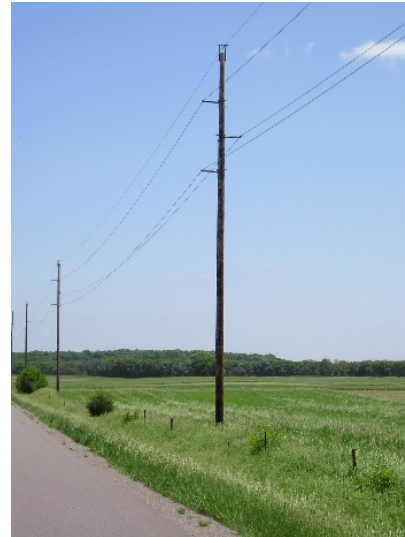
Typical 69-kV Circuit

State of Minnesota and Itasca County permitting authorities do not require a route permit or conditional use permit for 69-kV projects. Great River Energy is and will continue to work closely with the U.S. Forest Service, Minnesota Department of Natural Resources and Itasca County Land Department to acquire the necessary federal, state and county occupation permits for the proposed route.